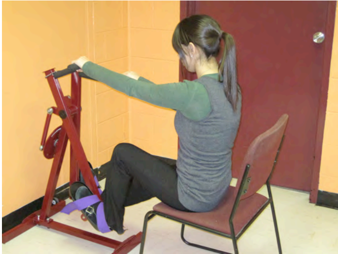
Figure #2. Training with the Pendulum Stepper from a seated position.